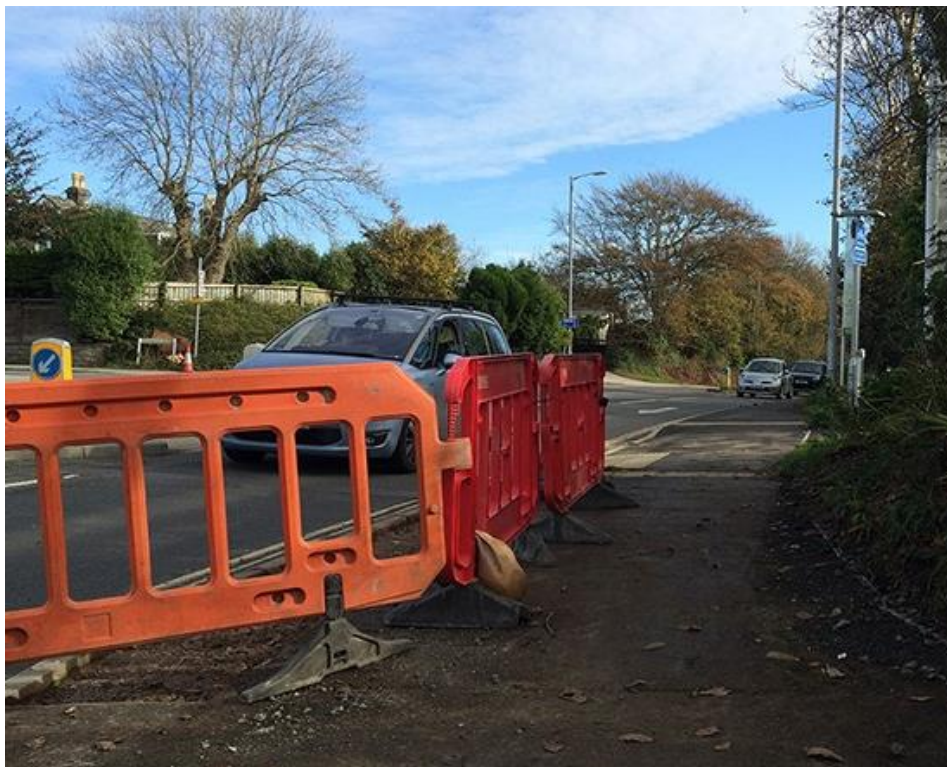
Plate 2 – Emerging Visibility East Onto Tresawls Road