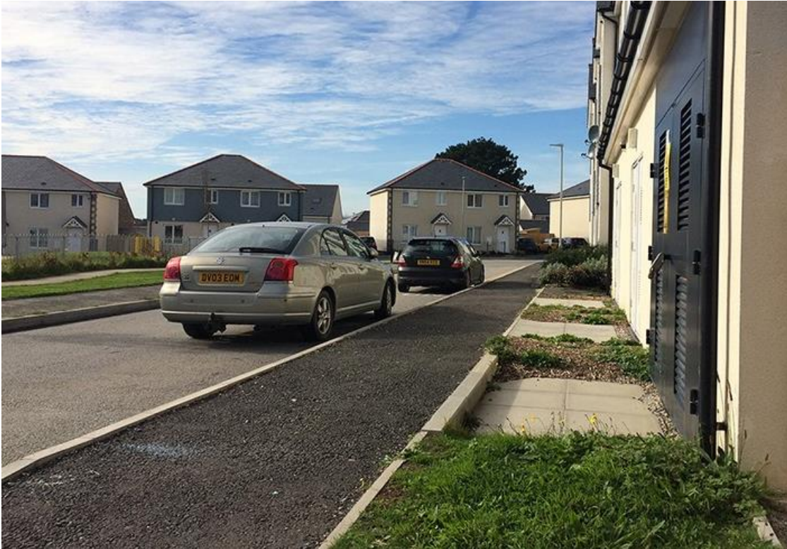
Plate 4 – Emerging Visibility West Onto Penwethers Crescent