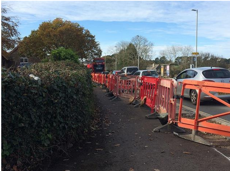
Plate 1 – Emerging Visibility West Onto Tresawls Road

part of the new build. A further existing space will be enlarged to create a disabled parking space. Plates 1 to 4 below overleaf demonstrate the existing emerging visibility from both access points.