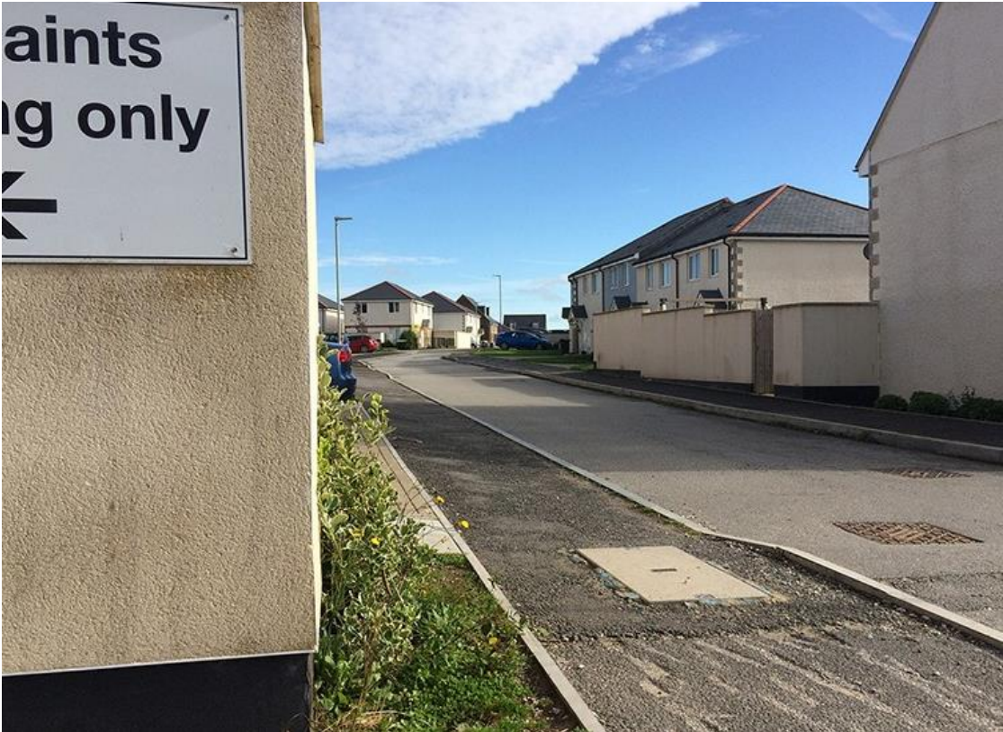
Plate 3 – Emerging Visibility West Onto Penwethers Crescent